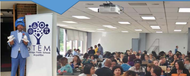
Chicago Public Schools Stem Camp and Googlepalooza