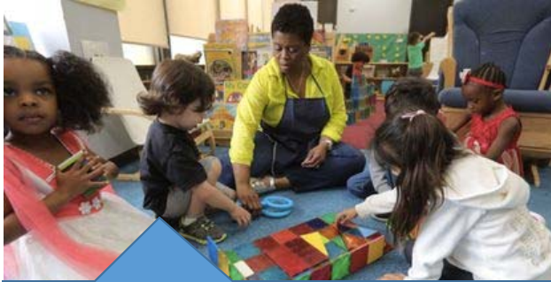
Truman's Early Childhood Laboratory School