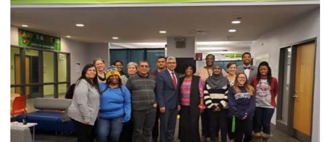
Campus and Beyond- Parent-Community Cafe