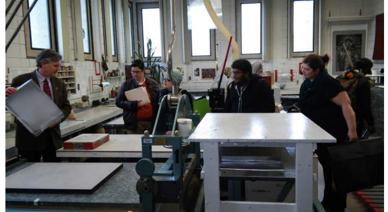
Visit to Northern Illinois University