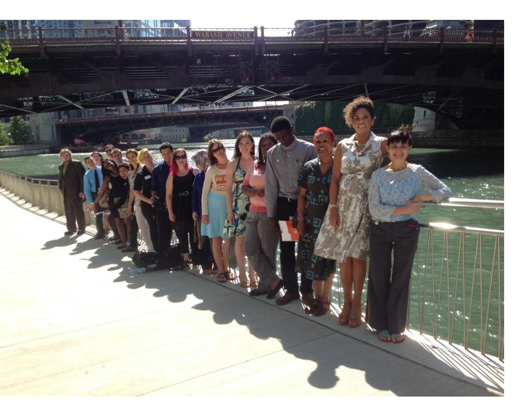
Research was supported by The City Colleges of Chicago Annual Plan funding